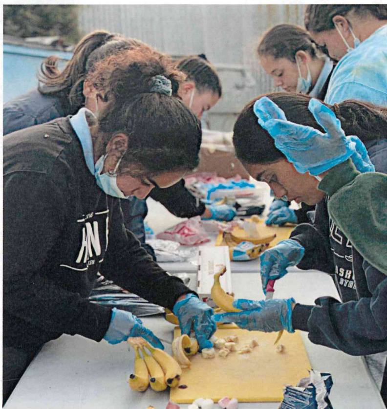
Year 13 hosting the hākari