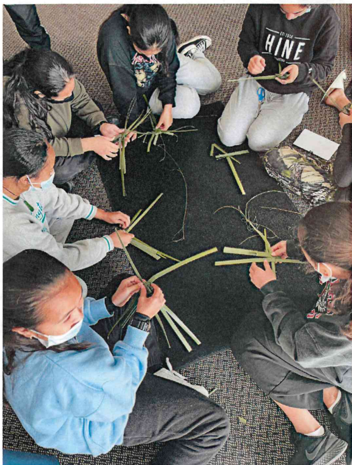
Making harakeke whetū