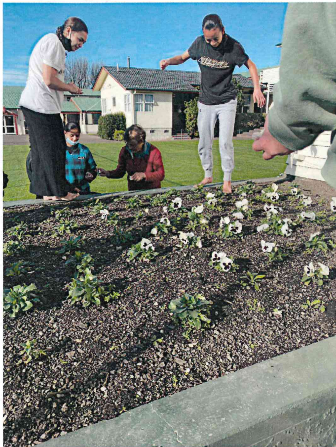
Year 9 “deadheading” the pansies